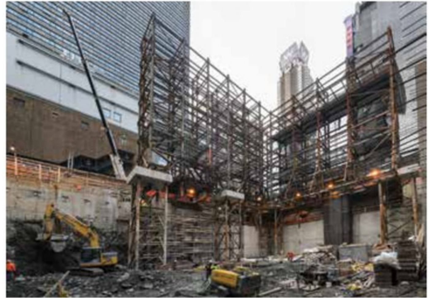
An as-built photograph of the existing structure and temporary support structure.