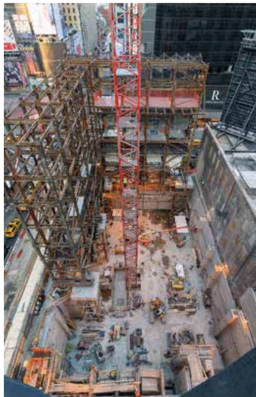
Overall view of the site at the completion of foundations.

Due to the limited documentation, a three-dimensional laser scan survey was conducted on the architectural shell early in the project and of the existing structure later as the project developed. Additionally, the temporary bracing structure was installed to suit the multitude of different field conditions, which arose during inception. Thus, the laser scan also served as a three-dimensional as-built rendering of the temporary bracing and stability structure. Once the existing and temporary bracing structures