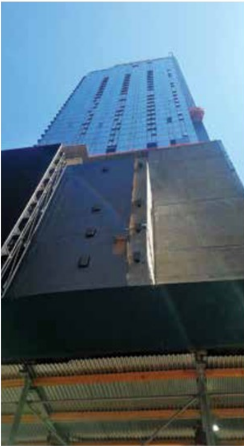
Topped out and clad.

system continued while the composite concrete and steel structure below gained strength with each passing day.