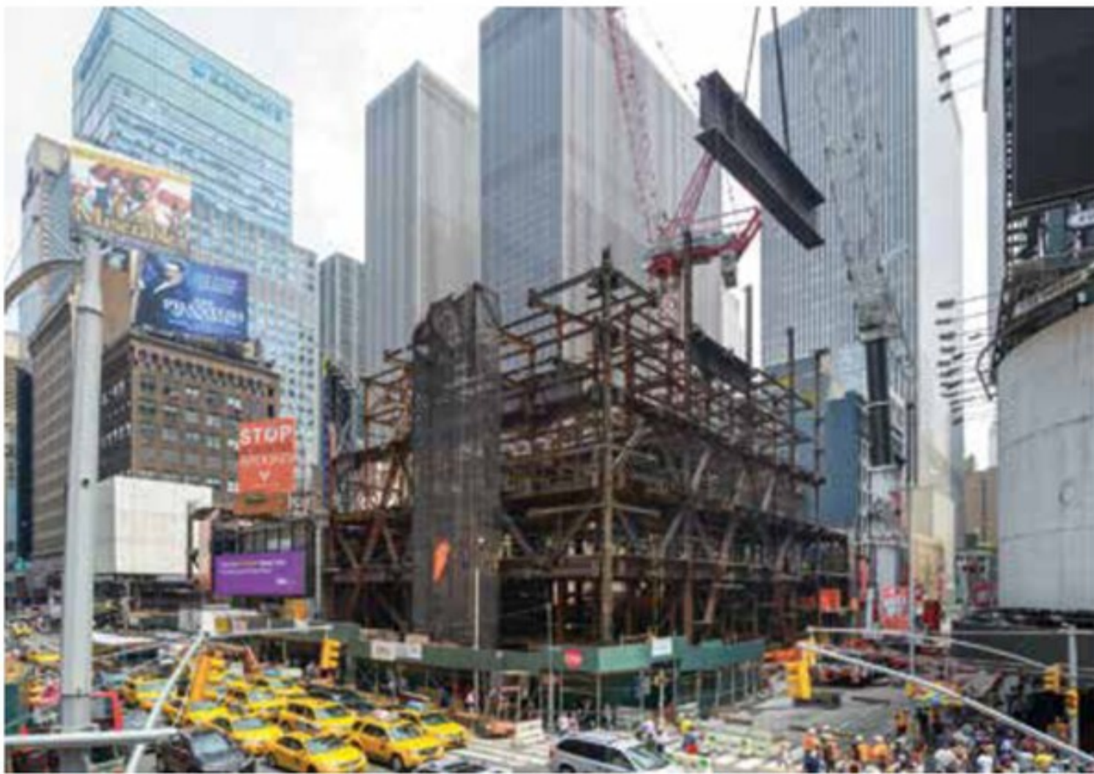
Erecting a 10-foot-deep plate girder for the seventh level transfer system.

columns. A well-positioned mechanical level served as the dividing line between the hotel and the retail spaces; nestled in this vast space of mechanical equipment, the transfer structure that supports the hotel tower was proposed. Thirty-five plate girders, ranging in depth from 36 inches to 120 inches, transfer the concrete columns, the largest of which was a ten-foot-deep by three-foot-wide element weighing more than 120,000 pounds.