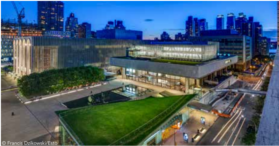
◀ The new structure provides increased capacity for the growing LCT3 program.

force combinations eliminated the need for an overall seismic retrofit of the entire building.