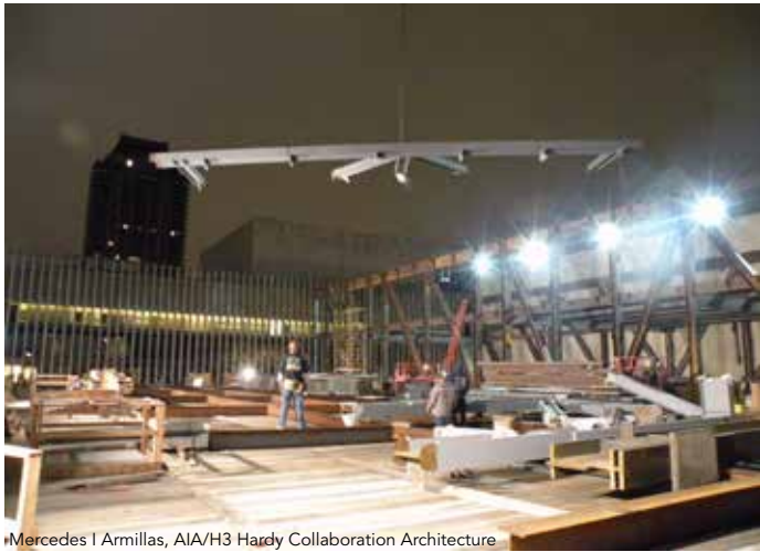
Mercedes I Armillas, AIA/H3 Hardy Collaboration Architecture

▲ One of the lifts performed by the Manitowoc 16000 crane.